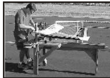
AJ. using a table

When you go to the flying field, you will notice four new starting tables placed behind each pilot's box. These are designed to restrain your plane when starting. They are placed so that the prop blast and exhaust do not blow into the pit area. Unless your plane is too large, please use the starting table. The tables were built by Bill Laughton and Dick Adams. Materials for one table were donated by Valley Lumber of Lander. Dick Adams, Rich Hardt and Bill Laughton donated the other tables. We hope to build more tables for placement in the pit area soon.