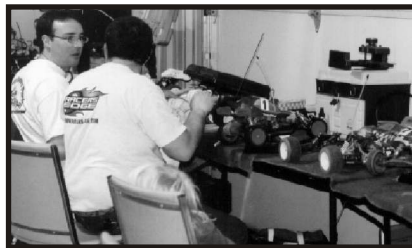
◀ Life in the pits