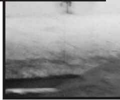
Shannon takes the quad with a modified motor