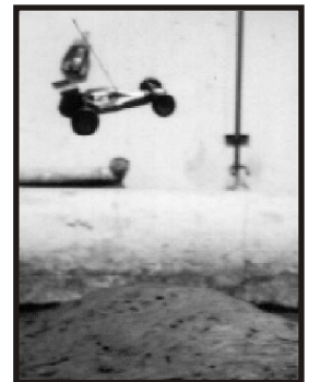
Becky flying high▲

Randy Dwyer 3 rd Place, 12 Laps in 5:07 Becky Dwyer 4 th Place, 12 Laps in 5:08